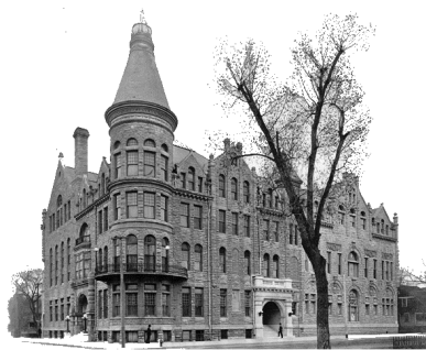
Wichita Scottish Rite circa 1908