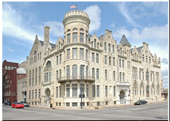
Wichita Scottish Rite, date unknown.

Second, freemasonry has recently been one of the subjects on Brad Meltzer's Decoded , an American mystery and conspiracy theory investigation television series on the History channel. Freemasonry is a fraternal organization that arose from obscure origins in the late 16th to early 17th century. It now exists in various forms all over the world with a membership estimated at around six million. In addition to knowing more about the history and architecture of the building, we also wanted to learn more about the background and philosophy of the Masons.